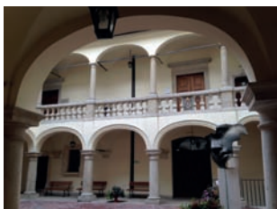
Jagiellonian University Collegium Juridicum