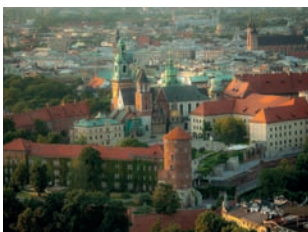
Krakow - Wawel Polish King Residence