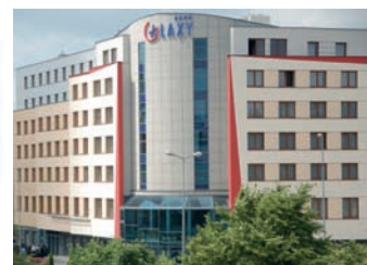
4* stars Galaxy hotel

Since 1978 Old Town Krakow is on the UNESCO List of Cultural and Natural Heritage