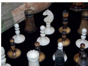
National Museum, chess